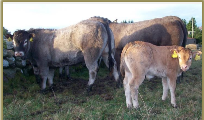
Cesar sired heifer and steer calves