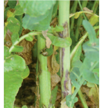
Light Leaf Spot infection on leaves and stems

As a direct descendant from Es Astrid, Cubic has a phoma resistance rating of 7 plus the same multigene resistance.