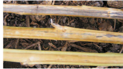
Symptoms of Verticillium wilt

The disease favours warm springs and there is no proven chemical control.