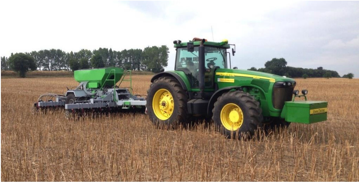
Here is the result of my Nuffield Farming Scholarship. No-till cover crops planted after oilseed rape on the 21st July 2014.