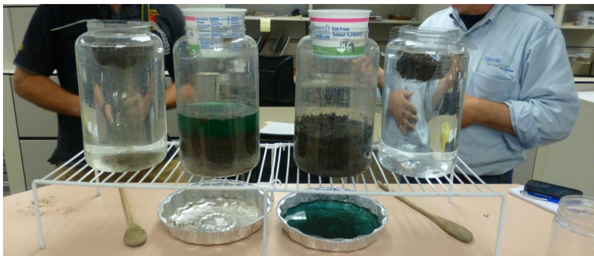
Conventional soil on the left, no-till on the right

On the conventionally cultivated soil the liquid poured in causes the soil to puddle and this liquid does not infiltrate very quickly at all. If this was a field scale trial the water would run off the surface of the field taking topsoil and nutrients with it and would cause damage to the soil in the process.