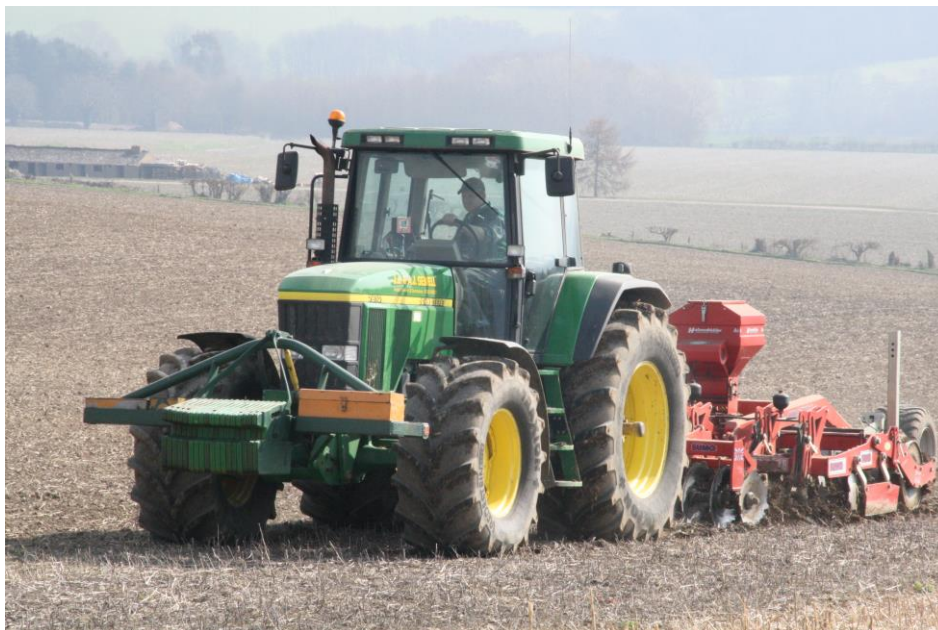
Our previous cultivation practice using a Sumo Trio cultivator

The aim of our post-harvest cultivation was to encourage a germination of any weed seeds and also any seeds and chaff that were missed or dropped by the combine. We also took this opportunity to try and level the fields and mix soil with the chopped straw thinking that this was best for rapid decomposition and the following crop. We had a seeder fitted to the Sumo Trio, which allowed us to plant oilseed rape (canola to my Australian and South American friends) directly into the soil in one pass.