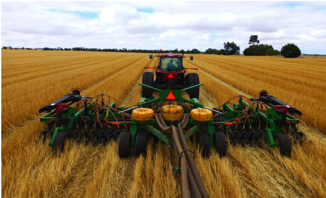
Tom Robinson in South Australia planting cover crops into barley stubble

The picture below shows Tom Robinson planting cover crops into barley stubble.