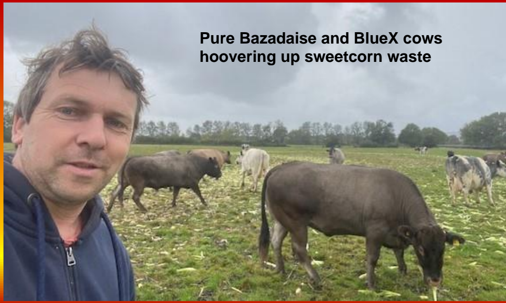
Pure Bazadaise and BlueX cows hoovering up sweetcorn waste

My grandfather moved from Dorset to Surrey in 1927 and to Sussex in 1936 where our family still rent our main farm. We were dairy till 1999 and then started rearing dairy bull calves in 2001 after the foot and mouth outbreak. We now rear over 2000 calves a year for finishers and ourselves.