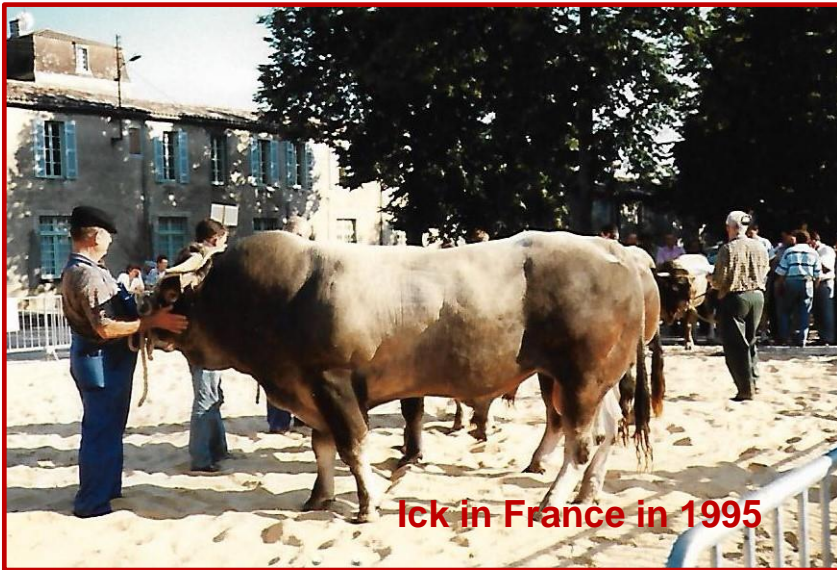
Ick in France in 1995