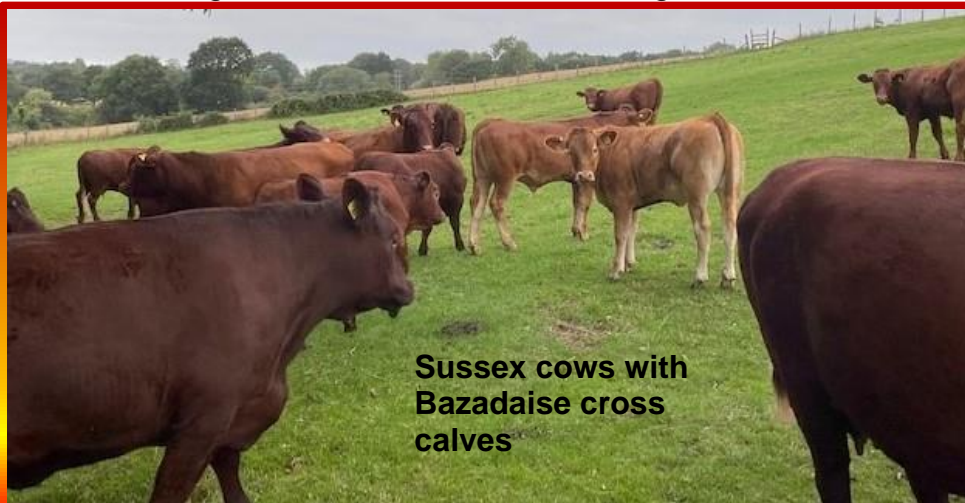
Sussex cows with Bazadaise cross calves

We run between 60 & 100 commercials most autumn calving, selling 20-30 with calves at foot. We were doing bull beef but as the calf rearing increased we now sell mainly off the cows.