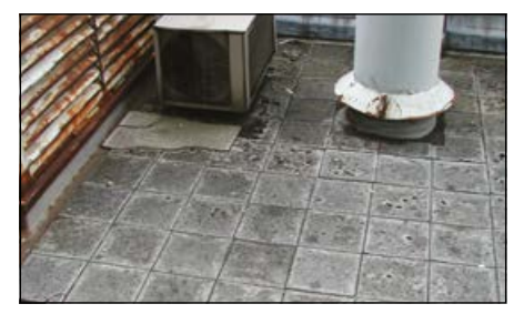
Asbestos cement tiles on a roof