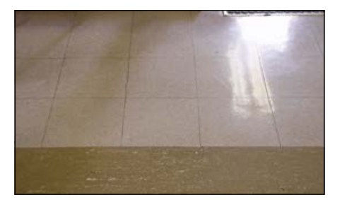
Interior floor tiles