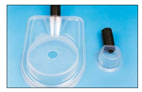
Drill cowl to contain drilling debris