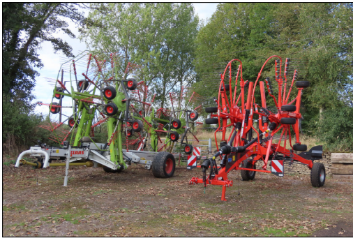
LOTS 15 & 14