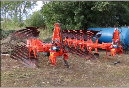
LOTS 2 & 1